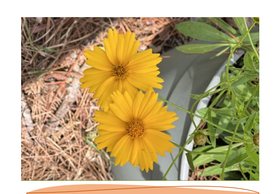
Coreopsis lanceolata blooms.

Did you know that Coreopsis is the Florida State Flower and there are 21 species?