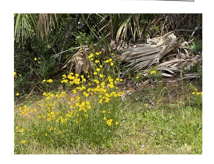
Coreopsis leavenworthii growing in small patches alongside roadway.