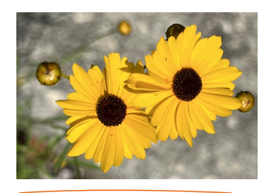
Coreopsis leavenworthii blooms.