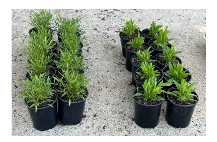
Foliage of both plants prior to blooming. Left- Coreopsis leavenworthii, right- Coreopsis lanceolata.