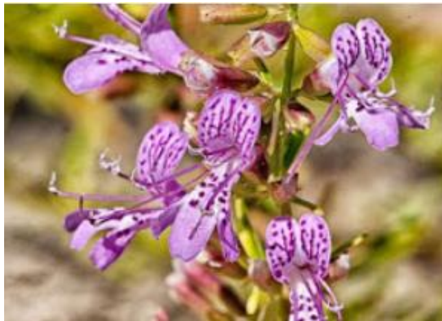
Titusville balm ( Dicerandra thinicola )

"Attracting Birds with Native Plants" will introduce the birds that often visit yards, their basic needs, and how to create a bird-friendly habitat at home. She'll also share tips and resources for creating your own landscaping plan, including examples of Brevard County natives you can use to attract our feathered friends.