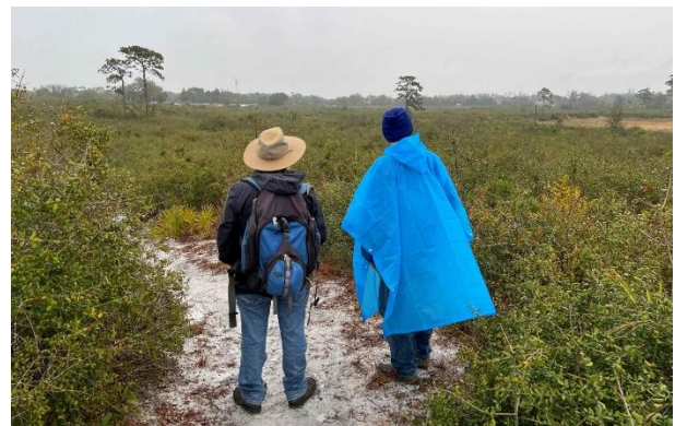
Photo 6: View from ridge. Habitat on ridge consists of scrub species.

The trail ascends from the flatwoods to a scrub ridge (Photo 6). This ridge is part of the Atlantic Coastal Ridge that formed about 140,000 years ago during a period of high sea levels during the Pleistocene epoch. The vegetation on this ridge is scrub with three scrub oak species (Chapman oak,