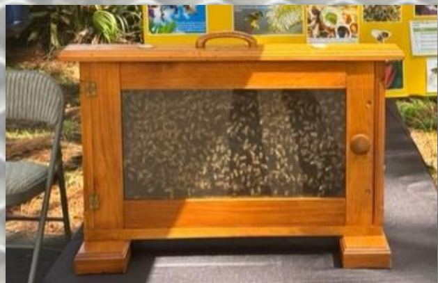
A temporary single-frame observation hive. This specialized case allows inner hive activities to be viewed up close.