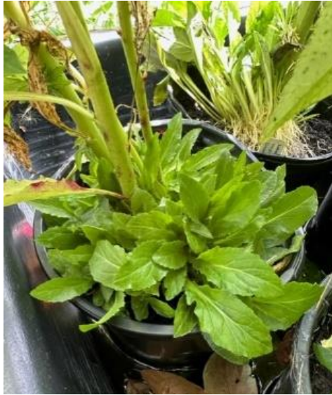
Basal rosette of cardinal flower as plant exits winter dormancy.

Are you looking to fill that garden wet spot, take a stroll along a stream, maybe watch a hummingbird feed? Then be on the lookout for cardinal flowers during your next nursery visit or outdoor activity as this plant’s native region encompasses the northern half of Florida and beyond. The water loving native features tubular red flowers on bloom spikes reaching 3 to 5 feet tall and a bloom period running from late summer through early winter when the plant enters winter dormancy. Although a short-lived perennial, some plants will perish after the initial bloom. Plant cardinal flower in moist areas along a body of fresh water such as a pond edge, stream margin, or even low-lying areas in partial sun. Cardinal flower will naturally self-sow if seed to soil contact is good, seeds are unencumbered by mulch, and soil is kept moist. For additional information on FNPS: http://www.fnps.org .