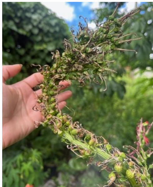
Once the blooms have been fertilized, seeds begin to develop. Cardinal flower may self-seed in the right conditions.