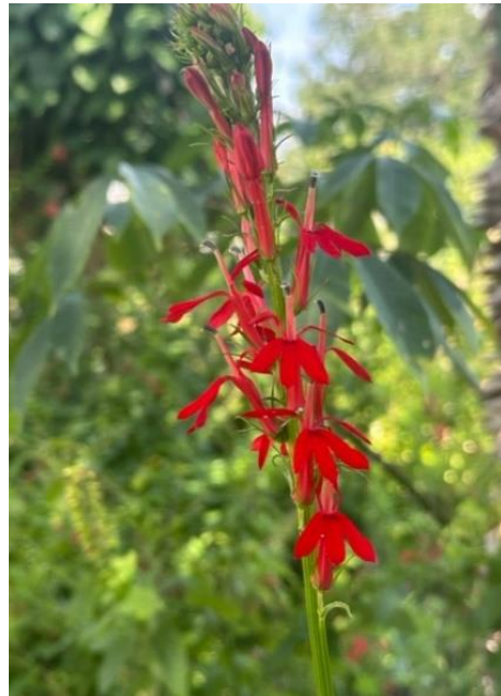
Blooms of cardinal flower, the flower spikes may reach 3 to 5 feet tall. Flowers are a valuable nectar source for thirsty pollinators.