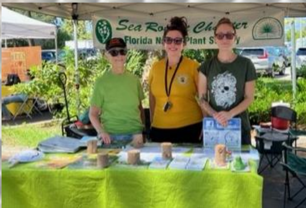
Volunteers operating our Chapter booth. Please contact rssecretary@fnps.org for volunteer opportunities.

This year's National Honey Bee Celebration was hosted by Brevard Backyard Beekeepers Inc. and held at the UF/IFAS Extension Brevard County Center in Cocoa. The Sea Rocket Chapter operated an information-based booth which provided festival participants with literature that focused on pollinator friendly garden techniques, native plant care, and planting guide selection.