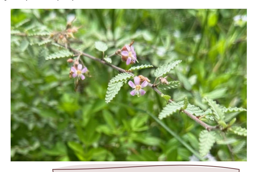
The thumbnail sized blooms of M. tomentosa range from pink to soft lavender and are clustered towards the growing point of branches.

Melochia tomentosa is a valuable Fall source of food for many species of native bee, honey bee, and small butterfly. The tea bush is exceptional at attracting the most diverse pollinators as this plant "buzzes" with life when in bloom. All this activity is easily achieved as tea bush are sun loving, drought tolerant, and low maintenance shrubs that are perfect additions to any xeriscape. The long thin branches give rise to sage green alternating leaves with scalloped edges.