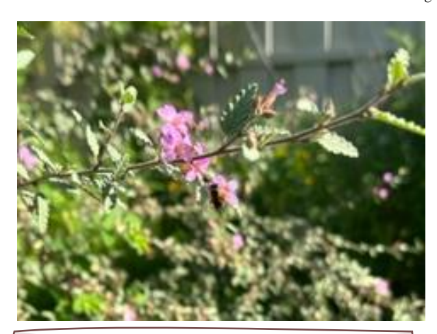
M. tomentosa blooms with pollinator. Several species of native bee, skippers, and hairstreaks frequent the blooms.