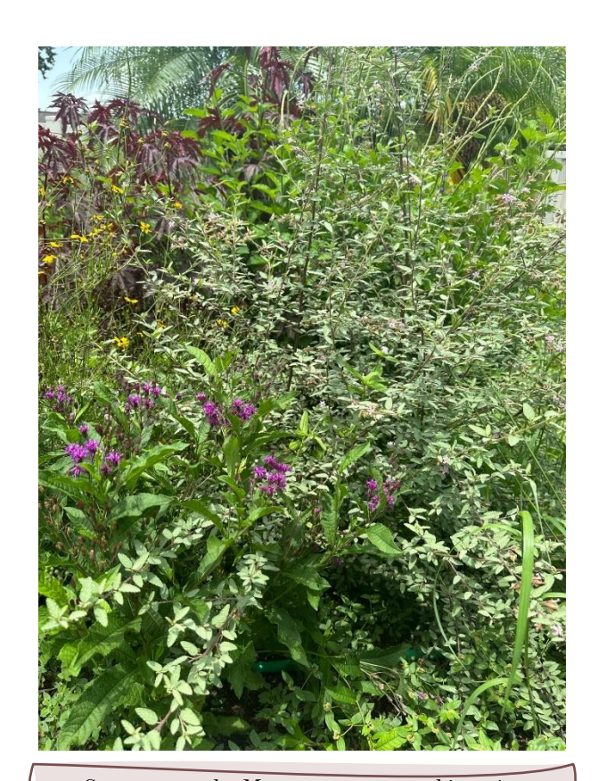
Can you spot the M. tomentosa among this native planting? It is just above and to the right of the giant ironweed blooms.

During blooming, five petaled lavender/pink flowers appear clustered towards the ends of the branches. The small leaves and flowers along slender branches give tea bush a wispy unique form that blends in with its garden neighbors.